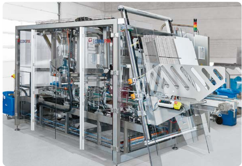
The ECONO-PAK SP-I-24 is a full-fledged packaging center. Here we work with our gearboxes in an extremely flexible and food-safe manner.

With 150 employees at its headquarters in Flanheim, ECONO-PAK specializes in packaging machines for the food industry, especially frozen food, and the non-food industry. The company has well over 1000 systems in operation worldwide. In the field of top-load machines, ECONO-PAK is actually the global market leader. Moreover, we were able to master a very special challenge for ECONO-PAK.